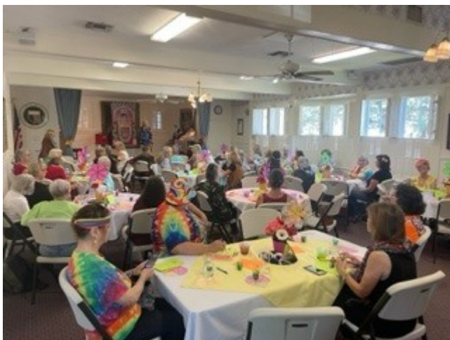
It's a full house for the '60's Party!