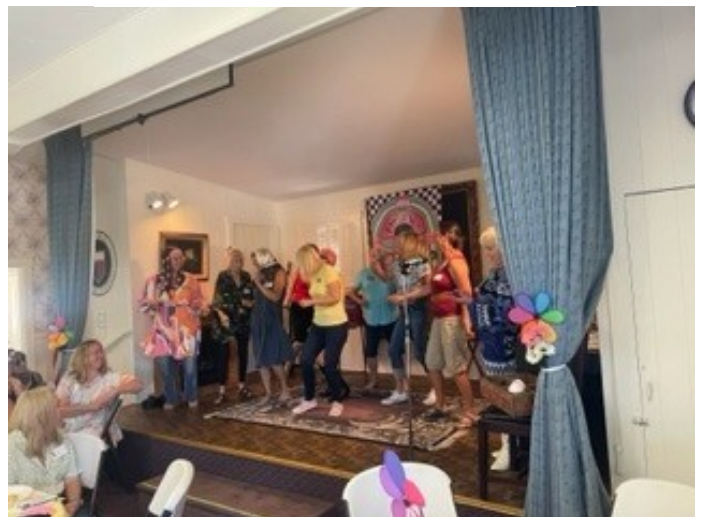
Dance Competitions were a blast!!!