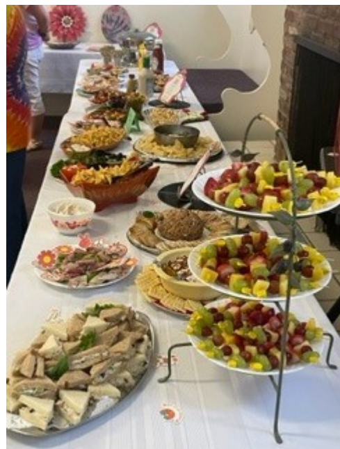
Food, Food, & More Food!!!