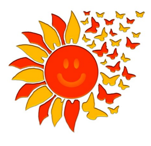
Growing and Grinning with GFWC!