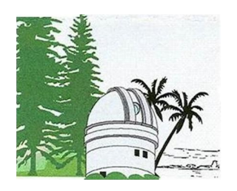
Organized June 1, 1958 Incorporated January 6, 1966 Website: www.gfwcpalomardistrict.org