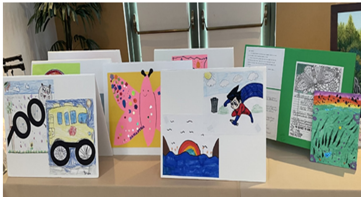
The creativity of these children is amazing!