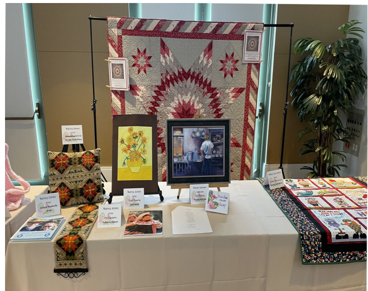
Art Show display of the lovely handiwork of our Club members.